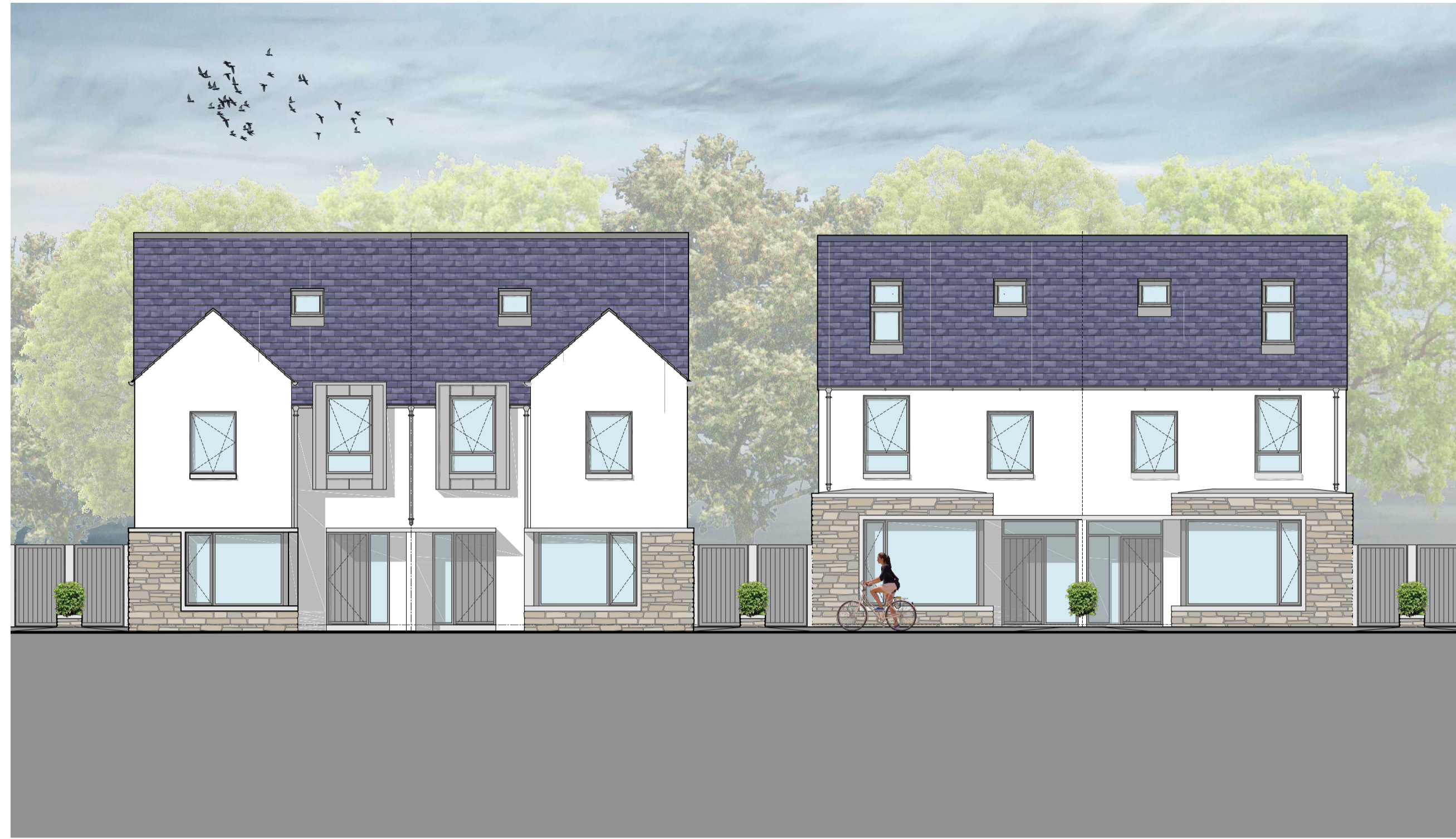
HOUSE TYPES A and B - FRONT ELEVATION SCALE 1:100